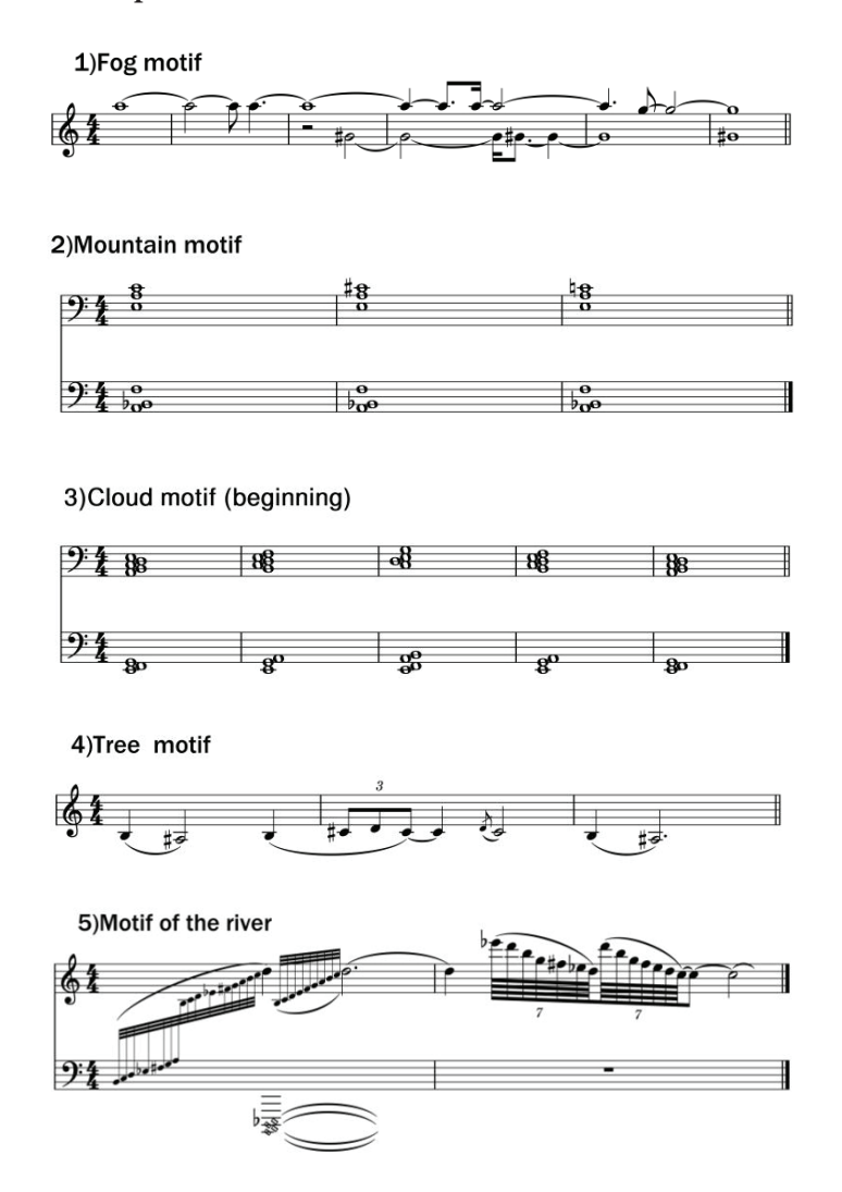
Example 1: Vladimir Trmčić, Late Autumn, musical motifs

Here below are examples of the musical motifs of the five elements that appear in the piece (Example 1): ^{31}