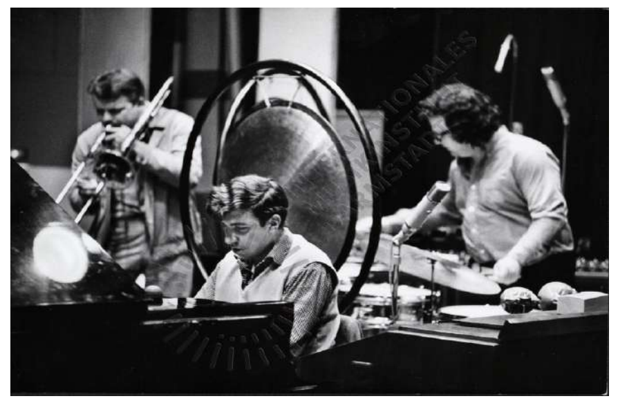
Photo 3: Free Music Group members: Vinko Globokar, Carlos Roqué Alsina and Jean-Pierre Drouet. Signature: IMD-B3000573 Date: [1970]