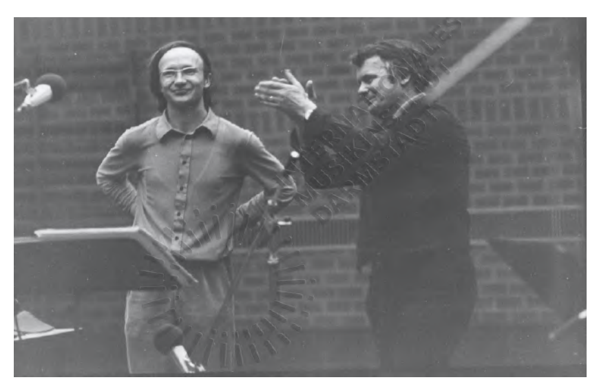
Photo 2: Heinz Holliger and Vinko Globokar on the microphone Signature: IMD-B3000587 Date: 1972