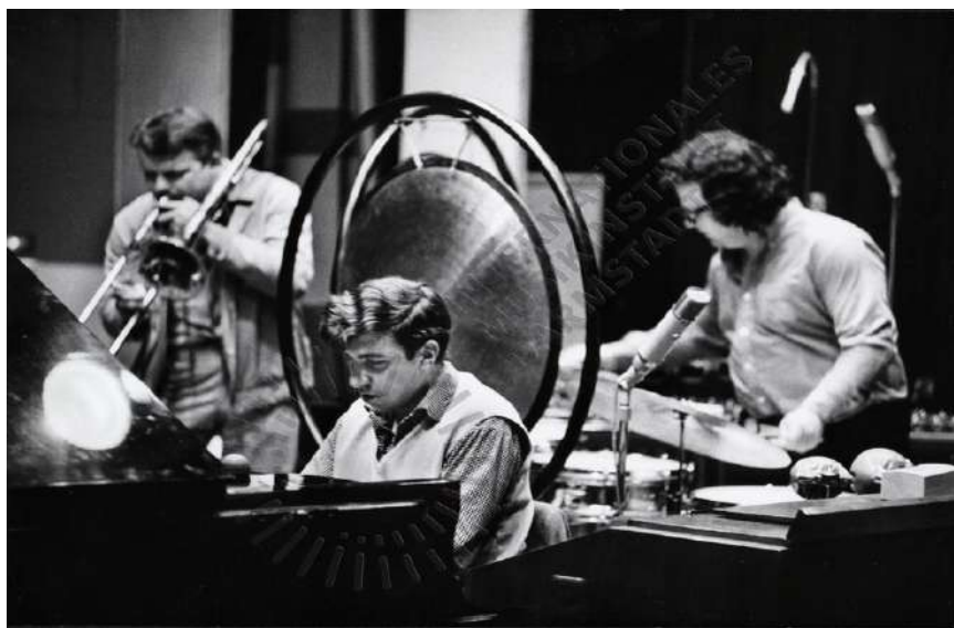
Photo 3: Free Music Group members: Vinko Globokar, Carlos Roqué Alsina and Jean-Pierre Drouet. Signature: IMD-B3000573 Date: [1970]