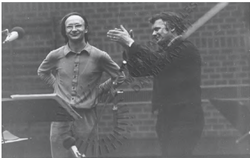
Photo 2: Heinz Holliger and Vinko Globokar on the microphone Signature: IMD-B3000587 Date: 1972